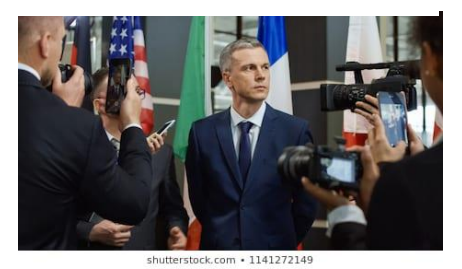
3 Politicians Giddy At Population Control Bill

control the masses. We need to de-regulate conventional cigarettes to end all of the raucous laughter and joy in a much more effective manner."