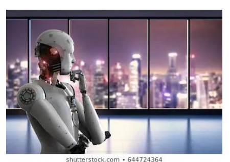
2 Robots Contemplating World Domination After Recent Epidemic

However, detractors have expressed concern over de-regulation due to e-cigarettes serving as far less effective population control. Republican Mitch McConnel brought up the ever-growing number of children on his lawn, showing the importance of having cigarettes dominate the smoking industry. "E-cigarettes just aren't good enough to